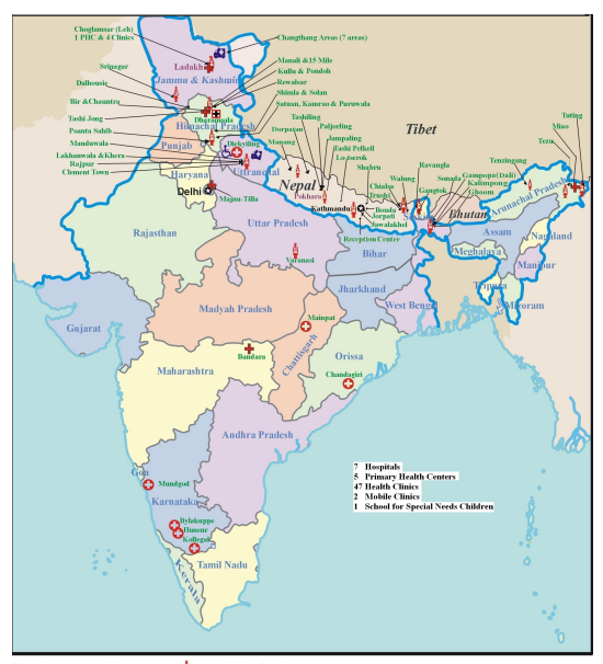
🕽 Hospital 🕂 Primary Health Center 🕴 Health Center 😓 Ngoenga School 🖚 Mobile Clinic 🞛 Delek Hospital and TMAI